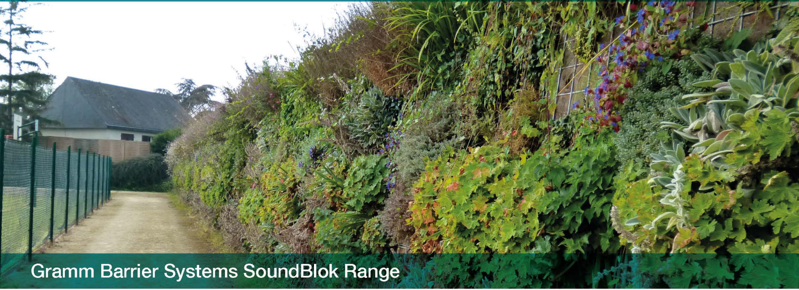
Gramm Barrier Systems SoundBlok Range